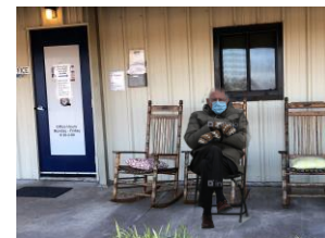
@ NTAC too??

If you chair a committee and want to included information in a future newsletter to create awareness and/or solicit participation, or just thank those serving on your committee, please send a brief synopsis similar to those above to ntacnewsletter@gmail.com .