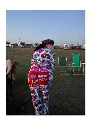
See you in the Fall & Safe Travels!!

Share your camping units activities, photos or plans, by sending them to NTACNewsletter@gmail.com!