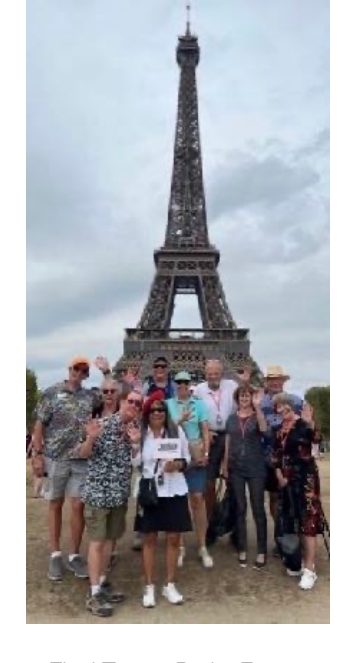
Eiffel Tower, Paris, France

France was our next stop, which included a tour of the Champagne region to the famous Mercier Champagne cellars in Epernay, France. In 1858 Eugène Mercier perfected the process of making champagne at the age of 20, creating affordable champagne for everyone! The next day, Paris!! We spent two short days in Paris, but it was enough to see the Eiffel Tower, a city tour of Paris with an excellent guide, and a free afternoon during which we sailed up and down the Seine River. Delicious food was to be had everywhere! This part of the tour included a trip to Chateau de Versailles,