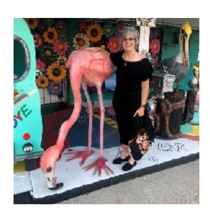
Sorry Kim, that one won't fit in the Airstream!

NTAC. Others are off to summer homes, road trips, and caravans, and won't be back until fall. Still others are holding down the fort at 200 Walnut Hill Avenue. How wonderful is it living in such a dynamic community? We always have interesting stories to hear and tell—and follow on Facebook, Instagram, and Twitter, if that's your thing. Even