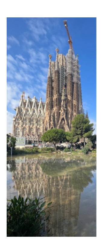
Sagrada Familia, Barcelona, Spain

The only reason I finally joined Facebook, so long after it wasn't for the cool kids anymore, was so I could share some posts with newsletter readers who, like me, swore they'd never join Facebook. Three issues in and I haven't shared a darned thing. Well, since there aren't any Airstream events bigger than the annual International Rally, I figure that's as good a place as any to start. I hope you enjoy these photos of NTAC neighbors Rolling to Rock Springs! (Next month, we'll bring some news from the rally itself.) We start with a few "leaving NTAC" photos.