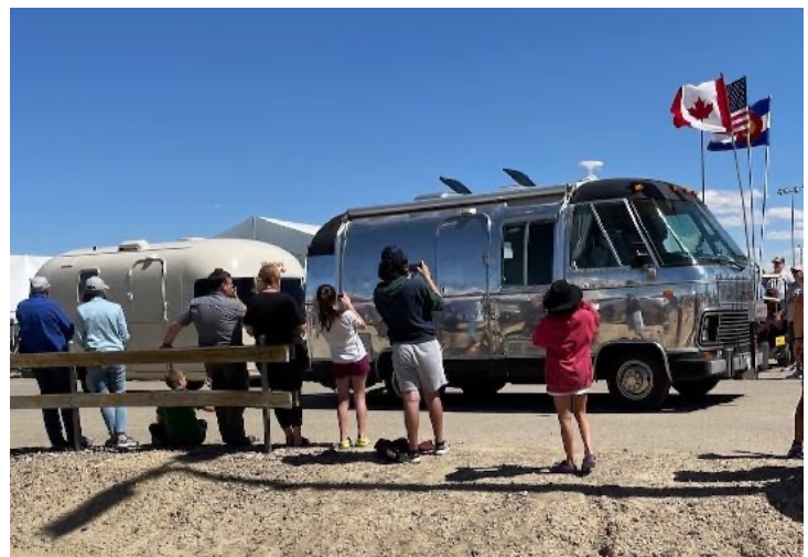
A 1977 Argosy motorhome pulling a similar vintage Argosy trailer. You don't see that every day!