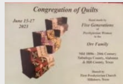
Announcing the Congregation of Quilts

consequences for all who came in contact with it — a sad and tragic history that involved many people. This quilt is shown on the announcement card on the bottom left and on a pew under the pipes of the organ in one of the pictures below.