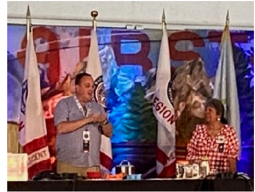
Gave away our first Instant Pot during the Instant Pot 101 class.