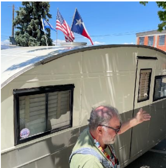
A 1946, non-Silver Bullet, Curtis-era trailer. How cool is that?

Oh no! I have this dead space that looks awkward. And the "July" newsletter is already into August. I don't feel like dragging and resizing content around until everything is nicely spaced out. What do I do? I know! I'll insert a couple pictures from the Vintage Airstream Parade at Rock Springs. At least it's in keeping with this month's theme. Wait, am I typing this out loud? Inside voice , NTAC Newsletter Editor. Use your inside voice.