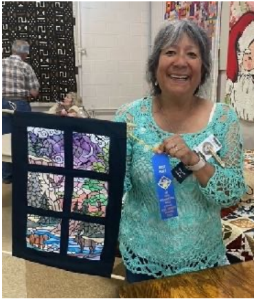
1st Prize for my embroidered stained glass.