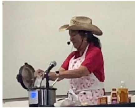
I had the first ever hands-on Instant Pot presentation that was a joint effort with the Dutch oven folks.