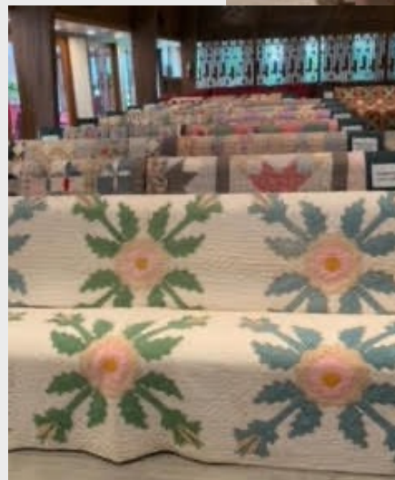
Watch out for that one in the back with the "poison green"