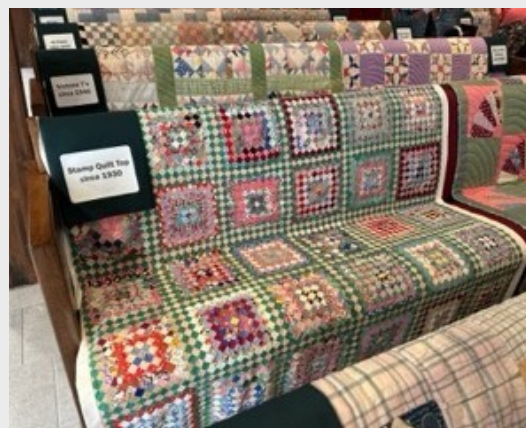
The 1930s Stamp Quilt

The oldest quilt on display was from the 1870s and has an interesting history related to one of the colors in it. Often referred to as "poison green" or Scheele's green for its 1775 inventor, Carl Wilhelm Scheele , it was a vibrant green that was said to be very appealing in late Victorian society and was one of the most popular colors in the 18th and 19th centuries. These bright colors were made from a deadly substance known as arsenic, which had dire