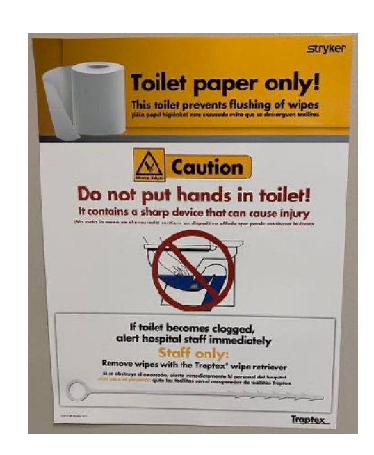
Seen in a Waco restroom

He reflexively snapped back, "I don't care who you know, buddy, I'm gonna give you a ticket anyway."