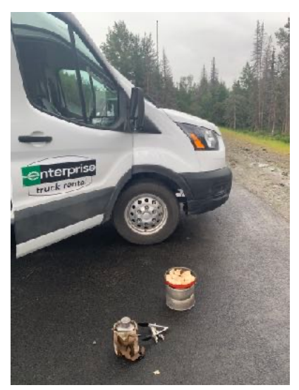
An "Enterprise"ing breakdown solution

We had to wait a few weeks just to get into a garage in Fairbanks. We were unable to rent a pickup truck (apparently they had all been rented by people fighting bush-fires). We hired a Ford Transit van from Enterprise whilst our truck was waiting to be fixed. We used the Enterprise rental van as a "van-life" vehicle and continued to travel with the Alaska caravan. It was a strange site on the Alaska caravan when all the Airstreams pulled into and parked up at the campsites and a white van with an Enterprise Truck rental sign pulled up along-side them.