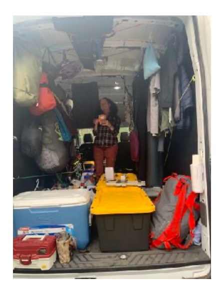
Looks like a happy camper despite the challenges

break the car window. The guys didn't want to break the window and waited until the police turned up and managed to break into the car (about 1:00am).