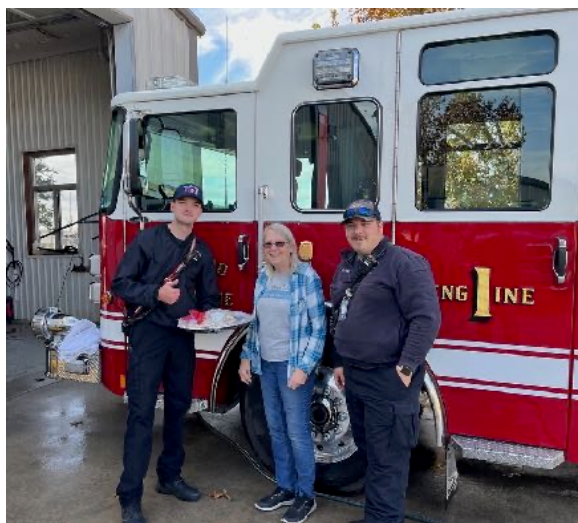
This isn't Roger Miller's "Engine, Engine #9," it's Hillsboro's Engine, Engine #1