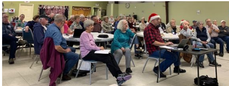
The meeting was well attended. Unfortunately, there was some rude guy with a Santa hat in a too-small chair at the front checking his stock portfolio instead of paying attention. Good job everybody else!