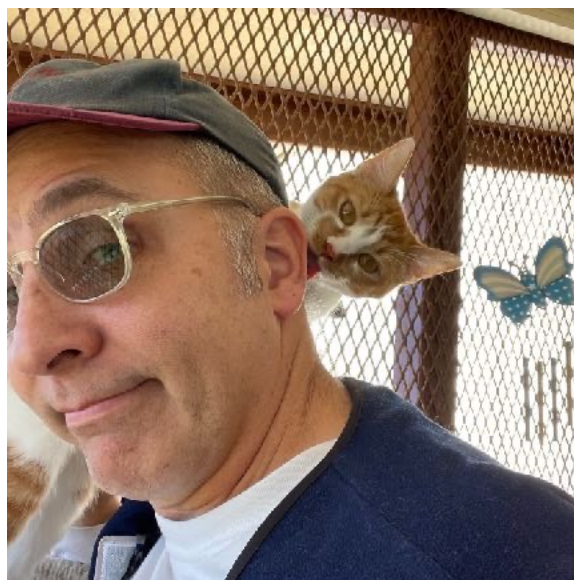
This is Lickin' Trixie, one of the beneficiaries of our largesse. Ear's to you NTAC!

The NTAC Newsletter is for informing and improving member awareness. Articles may not be republished, distributed, or shared in other media or forums without permission from the Newsletter Editor or NTAC Board of Directors.