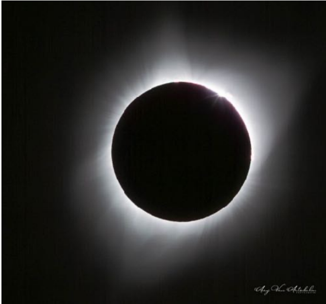
(in case you can't read the signature down there in the lower right corner).