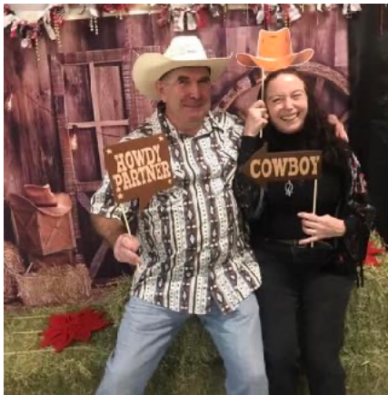
They don't come much more Texan than this pair