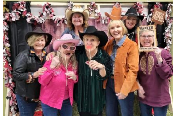
A septet of NTAC Cowgirls