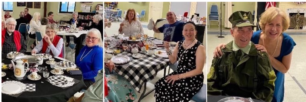
Various members dressed to impress!

This year the theme will be A Teddy Bear's Picnic with "Specialty Teas"