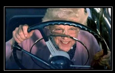
SNOWBIRDS They're back, and they're a year older.

Please Drive Safely and Defensively these holidays!