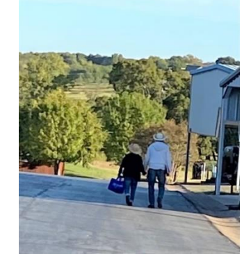
This is such an Iconic NTAC visual! Can you guess who this is?