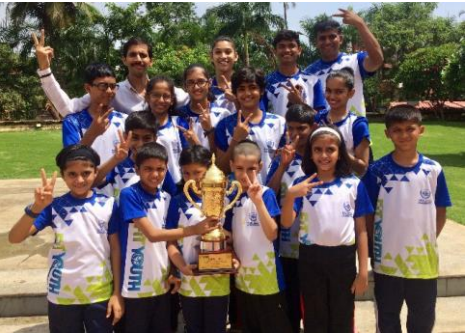
General Team Championship