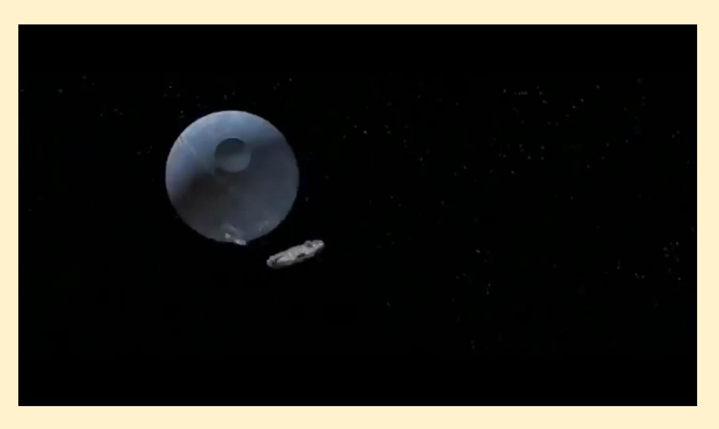
"Star Wars" (1977, LucasFilm/Twentieth Century Fox)