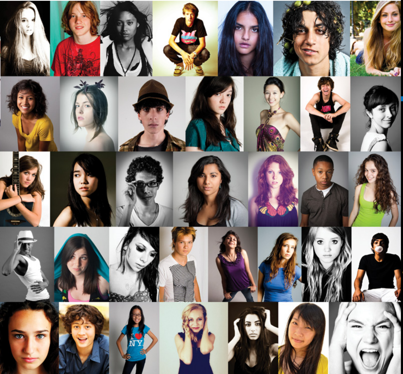
— A few faces of SOCAPA photographed by students in the Photography program.

SOCAPA’s “Advanced D&D Art Workshop” in New York City is for our return photography students and students who have extensive experience with digital and traditional 35mm black and white darkroom photography. Advanced Photography students will have the opportunity to work in medium format. In addition, students learn to use the myriad tools Photoshop and Lightroom have to offer in order to create exciting images. A strong emphasis will be placed on portfolio development and each student will be encouraged to create a body of work that showcases his or her own unique creative vision through thematic and stylistic choices.