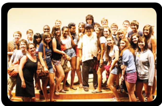
Actor Luis Guzman ( Traffic , Boogie Nights , Punch Drunk Love , Carlito's Way , Anger Management ) with SOCAPA students after a Master Class.