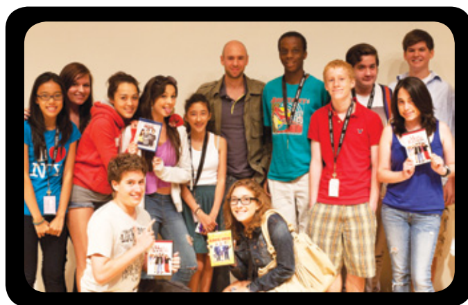
Writer/Director John Hamburg ( I Love You Man , Along Came Polly , Safe Men , Zoolander , Meet the Fockers , Little Fockers ) after a SOCAPA Master Class.