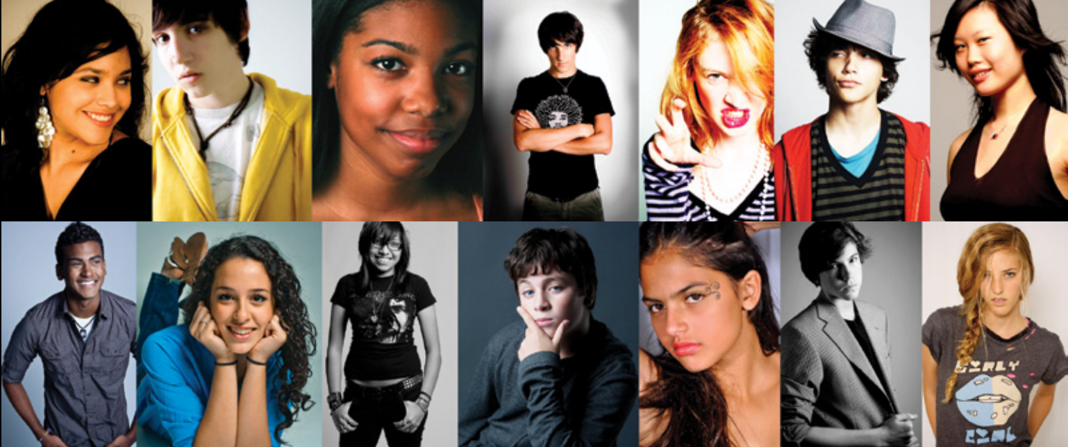
– Sample Actor Headshots taken by SOCAPA Photography Students

ites. Monologues are memorized and rehearsed during the final week and are performed live on the last day of the program. In addition, acting students are scheduled a block of time in the studio to have their headshots done by the Photography Program (see samples above).