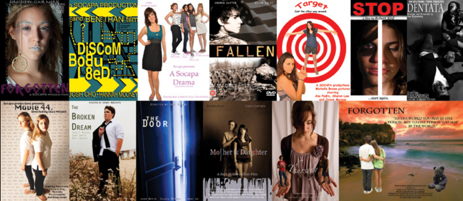
— Sample Movie Posters of student films designed by SOCAPA Photography Students featuring SOCAPA Actors. That's collaboration!