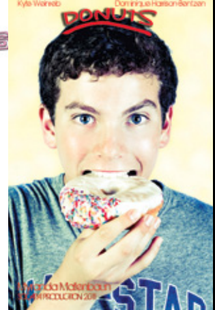
— Sample Movie Posters. (More on page 14)