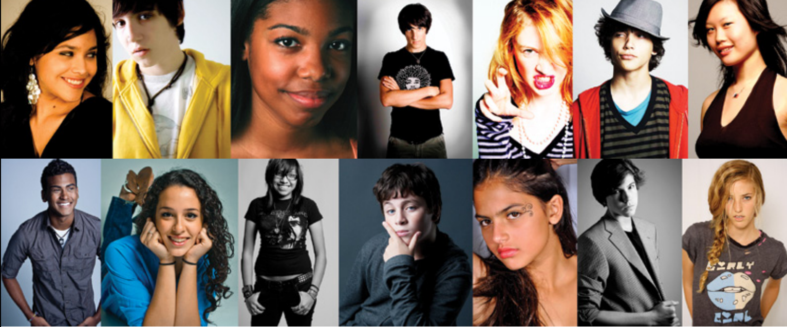
Sample Actor Headshots taken by SOCAPA Photography Students

ites. Monologues are memorized and rehearsed during the final week and are performed live on the last day of the program. In addition, acting students are scheduled a block of time in the studio to have their headshots done by the Photography Program (see samples above).