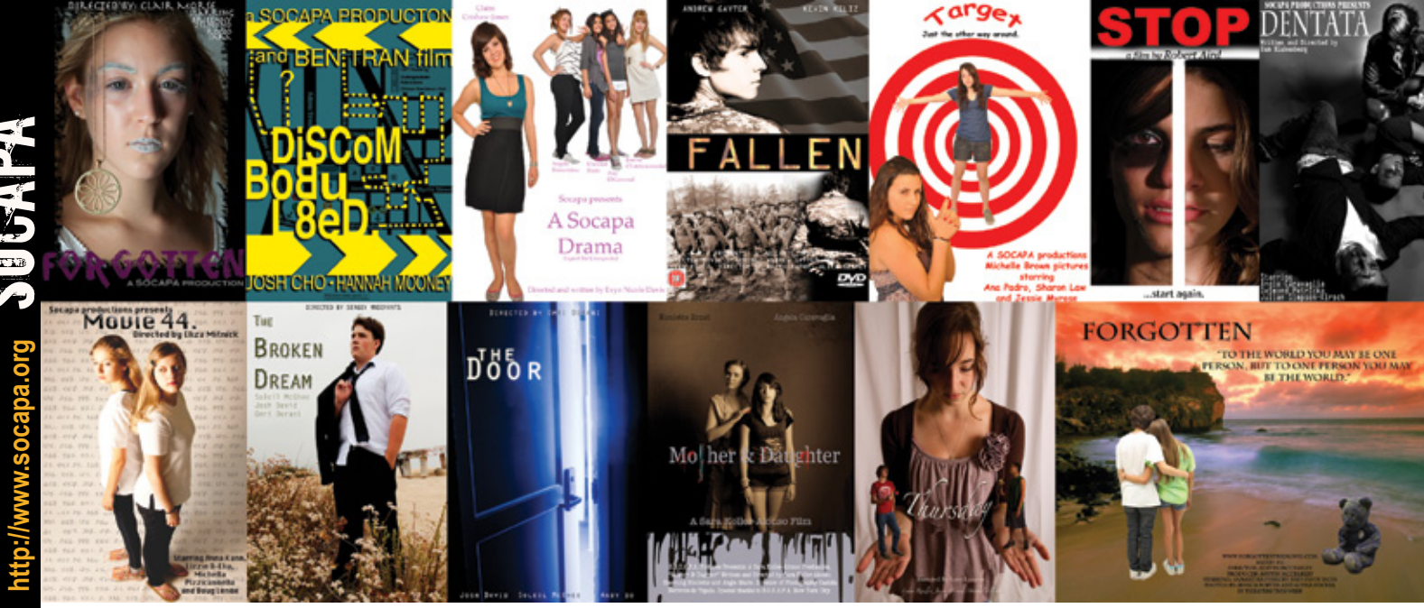
- Sample Movie Posters of student films designed by SOCAPA Photography Students featuring SOCAPA Actors. That's collaboration!