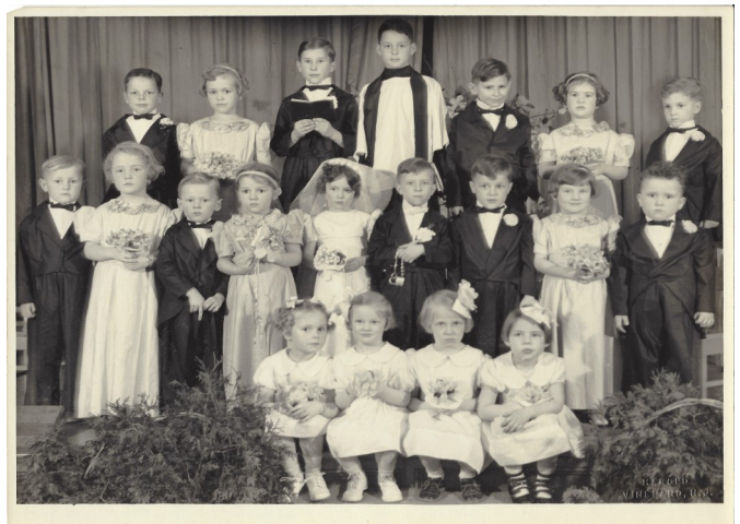
A "Tom Thumb" wedding held in Vineland.