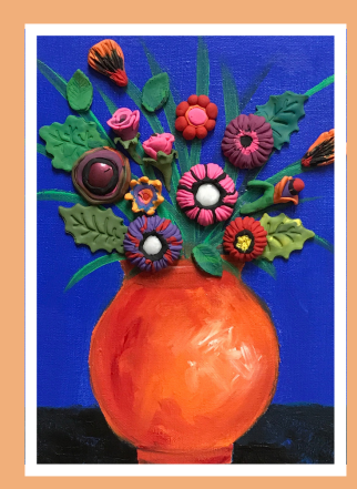
2.5 HOURS $55 Per Person