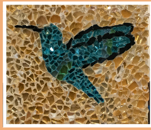
2.5 HOURS $59 Per Person