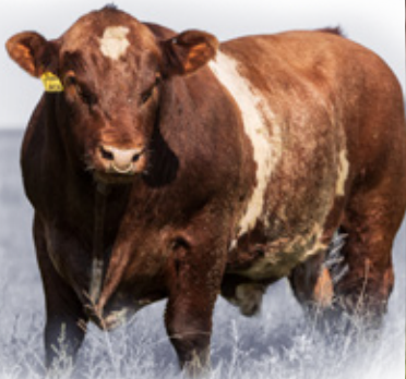
BYLAND CASH - Sire of Lots 2C, 2E, 2F, 5, 5A, 7-7B, 12, 19, & 20