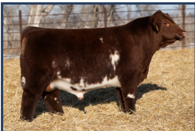
JSF BANK DRAFT 119L - Full brother to lot 20 Herd sire for Deerhorn and Bar N Cattle Co.

*X4373109 | C | 2/28/2024 | ROAN | POLLED | JSF 71M