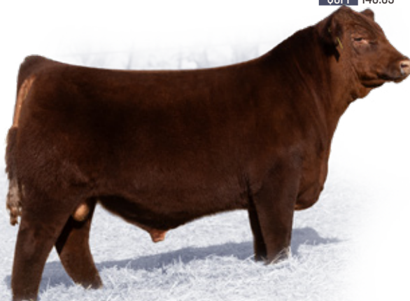
JSF SOLITAIRE 250L - Son Of Kendra | Durham in the Dakotas 2024 High Seller to ST Genetics, Mckenzie Ranch, and Kafka Cattle Co.

The Dam of White Noise & Solitaire with perhaps her best work yet on the opposite page. Scary to think that in 3 calves, all by different bulls, she hasn't missed yet. Legit Home Run Hitter here. Mate her however you wish and know that she can make them, regardless of the sire.