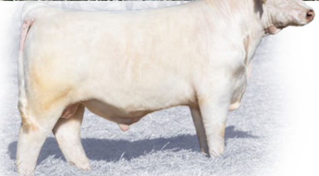
JSF MANTLE 140L SON OF PRINCESS

SELLING ONE PACKAGE OF 3 IVF SEXED HEIFER EMBRYOS BY JSF SPRINGSTEEN 183K.