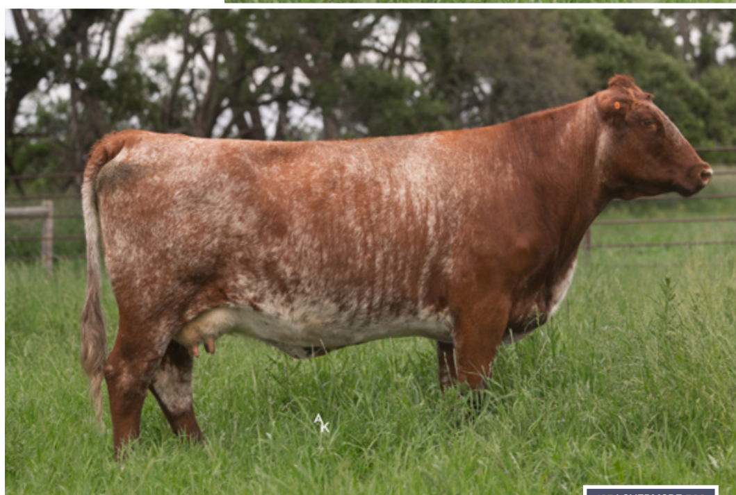
JSF LOVERMORE 52G