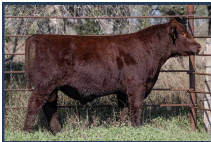
DEERHORN UPSTATE 206K - Service Sire of Lots 73 - 83

BW -0.6 WW 47 YW 65 MK 23 SCEZ 40.39 SBMI 125.62 SF 47.86 SCPI 158.19