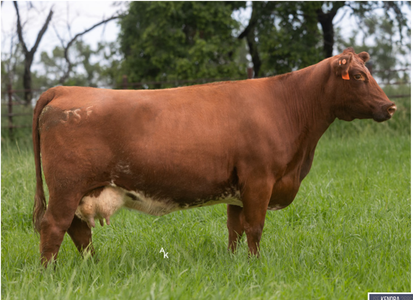
JSF KENDRA 268G

*X4339485 | C | 4/22/2019 | RED | POLLED | JSF 268G