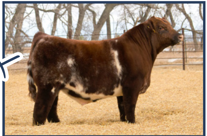
JSF PALERMO 172H ET - Maternal Grand sire of Lot 2