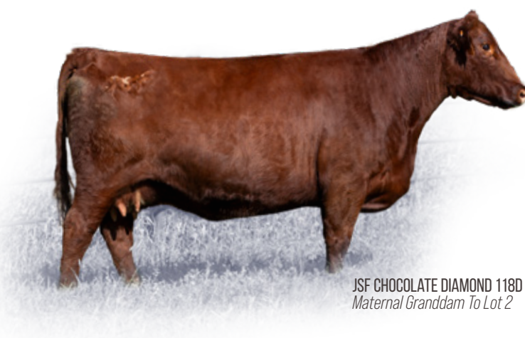
JSF CHOCOLATE DIAMOND 118D Maternal Granddam To Lot 2

It's no secret that White Diamonds are the rarest of the rare, and, most valuable. We have one, and, are making her available to you in her entirety, 5M. I hope she brings it. She's worth every penny.