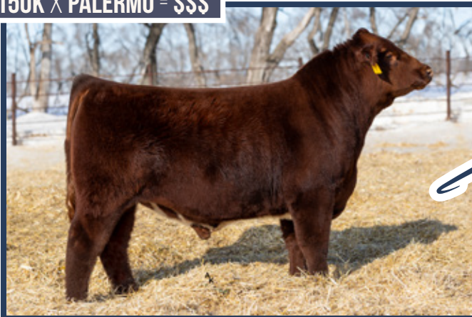
JSF 150K - Sire of Lots 2 & 4