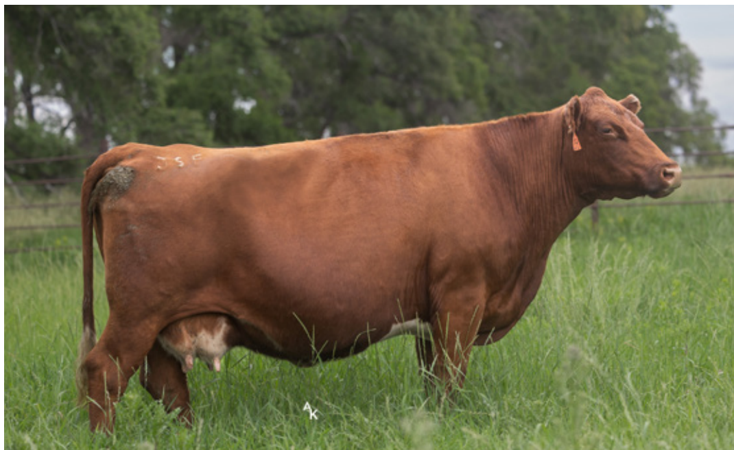
JSF ADELAIDE 83B

CHOICE LOT. Offering the Right to one flush on either JSF Lovemore 52G or JSF Adelaide 83B. Seller guarantees 6 Transferable embryos on either cow. Flush to take place between 12-1-24 and 4-1-25.