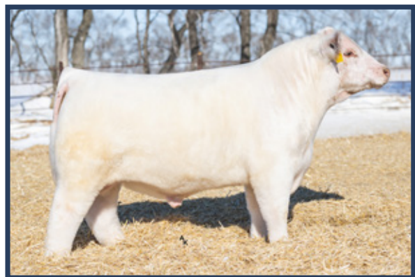
JSF WHITE NOISE 42K - Son Of Kendra | Durhams in the Dakotas 2023 Top Seller to Smith Farms, Litchville, ND and our High Selling AI Sire Over the Last two Years.

Selling the right to one flush on Kendra 268G. Buyer pays all Flush costs. Seller guarantees 6 transferrable embryos with no cap to the buyer. Flush to take place anytime after 12-1-24 and prior to 4-20-25. She is currently averaging 12 embryos per Flush.