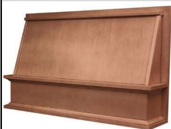
Painted or Stained to Match Cabinet Finish

Kitchen Cabinets- 30"- 36" Wide Pantry Cabinet w/ Adjustable Shelves (Upgrade 2 Cabinet Line)