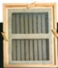
Double Screen B91601 $22.50