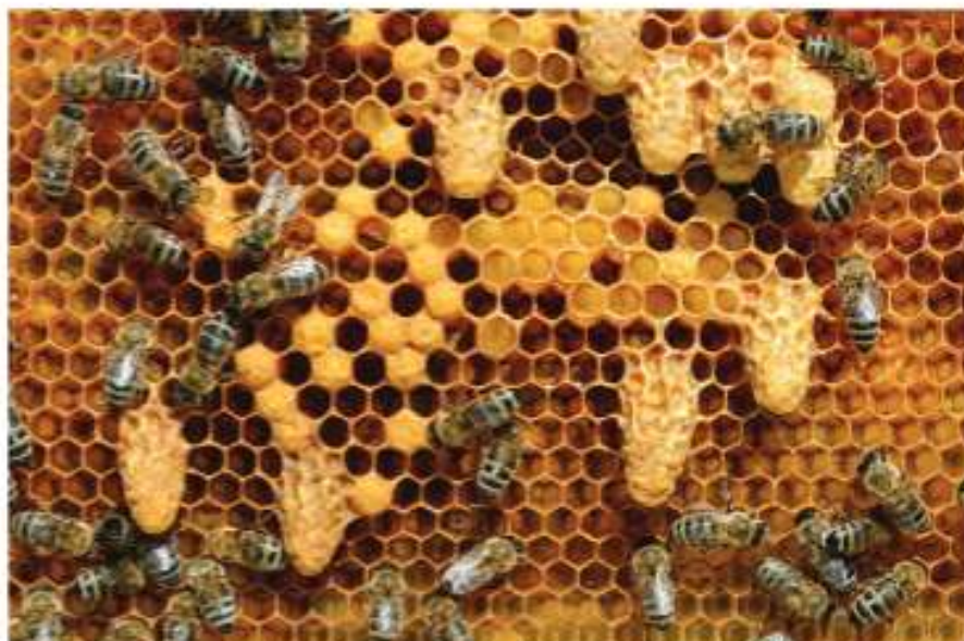
Several emergency cells can be seen in this photo. Notice how the bees draw them out from a worker cell, rerouting the development into a queen trajectory.

Begin by removing any honey supers from your chosen hive and set them aside. Cover them with a towel or other cover to help keep the bees calm. Next, remove the upper hive body and set it beside your spare hive body on a top cover or other flat surface on the ground.