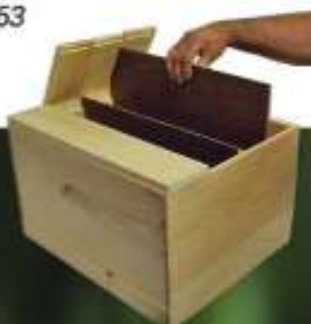
Queen Rearing Hotel B55101 $44.00