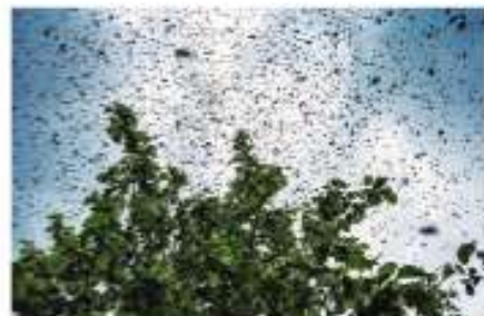
Prevent swarming by harvesting that energy of the bees.

In the spring, when honey bee populations grow rapidly, nurse bees are apt to prepare for swarming by producing queen cells. While not all aspects of swarming are completely understood, I remember reading, although I can't give proper attribution,