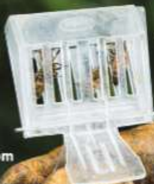
Queen Clip Catcher M00659 $4.95