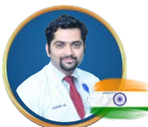
SOUBHI K CHEL LVPEI, India