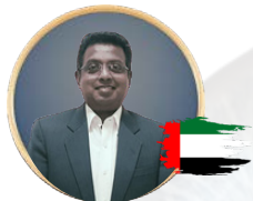
SRI DHAR SWARNA Sight Savers Optics, UAE