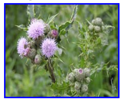
The flowers are pinkish purple and arranged in clusters.