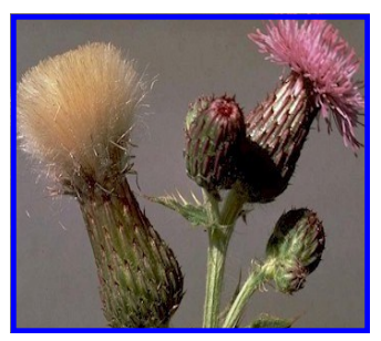
The pinkish purple blossom contains several hundred seeds, in a head similar to that of a Dandelion.