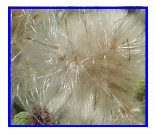
Canada thistle seeds are slightly tapered and have a tuft of tan hair loosely attached to the tip to enable wind dispersal.

The average seed production is about 1,530 seeds per plant, but exceptional plants may produce up to 5,300 seeds. Seeds can remain viable in the soil for up to 20 years. However no seeds will be produced without the presence of both male and female plant's. There is no viable seed in the male plants.