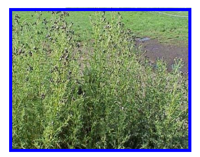
Canada thistle can often be found near irrigated fields.

<u>Larinus planus</u>: Attacks Canada thistle and reduces seed production. These larvae feed on the flowers, and the adults consume foliage. Therefore, infested buds often become distorted and fail to open. These bio control insects seem most appropriate in remote inaccessible pastures and on range land where mowing or treating with herbicides is not practical.