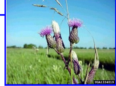
Some good news: If the plant is male, the seed in the fluff you see blowing in the wind is sterile.