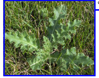
Rosettes form in late April through May.

There are two biological control agents found to be helpful in some cases at controlling Canada thistle. Both are seed-head eaters, that will destroy most seeds in a flower head, but have little impact on eradicating or reducing an established root system.