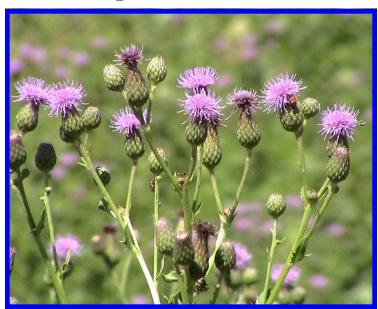
One plant can colonize an area 3 to 6 feet in diameter in one or two years.