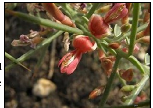
Pea-like flowers occur in clusters