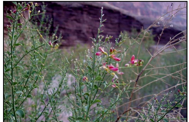
Flowers concentrated on upper portion of branches