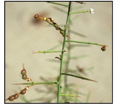
Seeds clearly outlined in the pod