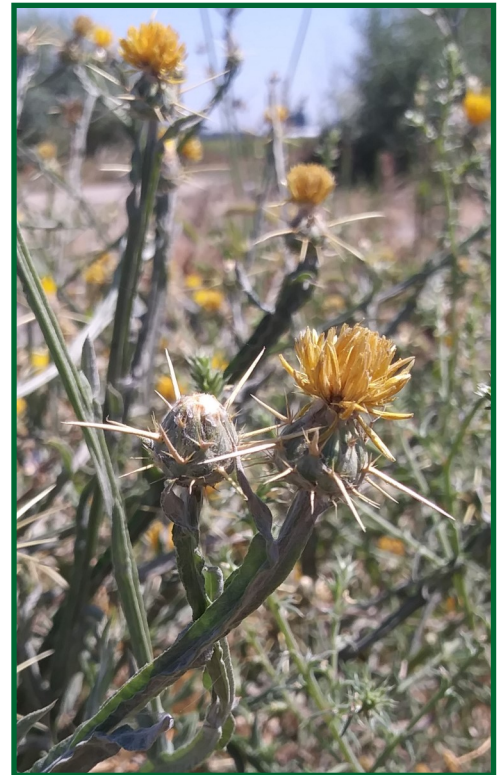
Flower bracts are armed with sharp spines.