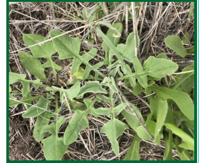
Rosettes resemble dandelions.