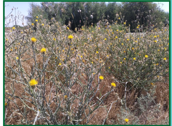
A yellow starthistle infestation in bloom.