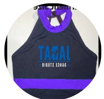
Tiny Tot Tutu