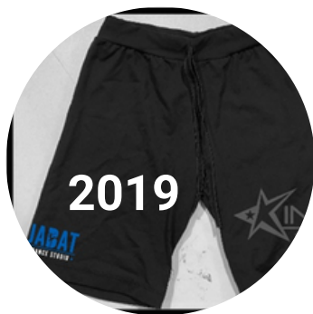
Boys Drawcord Short

ALL shoes and tights are available online from: Energetiks ( https://www.energetiks.com.au ) OR Bloch ( https://www.bloch.com.au/pages/dance )