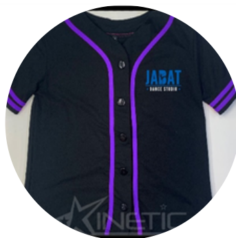
JaBaT Top (available in Purple and Blue)