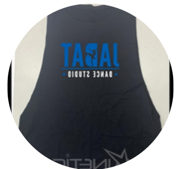
Punk Rock Singlet