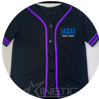
JaBaT Top (available in Purple and Blue)