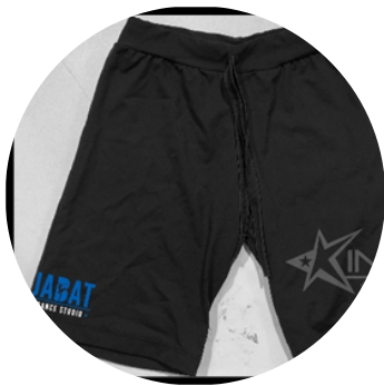
Boys Drawcord Short

Bloch ( https://www.bloch.com.au/pages/dance )