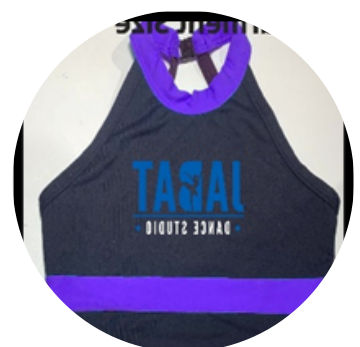
Tiny Tot Tutu