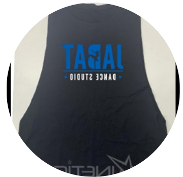
Punk Rock Singlet