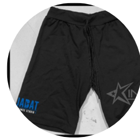
Boys Drawstring Shorts $45.00