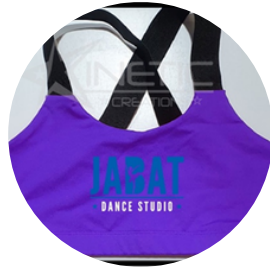
Crop Top $40.00