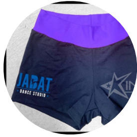
Hot Shorts $40.00

Bloch ( https://www.bloch.com.au/pages/dance )