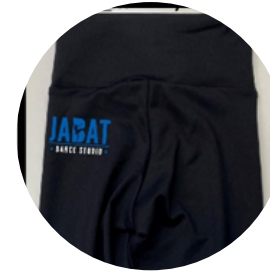
Laura Leggings $50.00