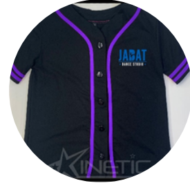
JaBaT Baseball Tee (available in purple or blue) $45.00