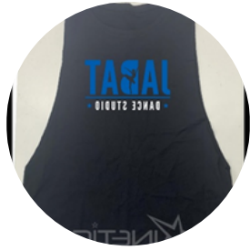
Punk Rock Singlet $30.00