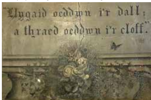
A relic from the workhouse, currently at Llandoverly surgery.

The sleeping accommodation for vagrants attracted particular criticism. Iron bedsteads were covered only with loose coconut fibre, while the rooms themselves were described as foul-smelling and unwholesome. The newspaper argued that the conditions resembled "the lair of wild beasts" and suggested that the Union would save money by closing the institution altogether.