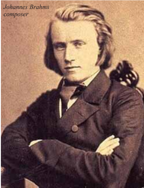
Johannes Brahms composer

At the young age of just thirty-three years, intense personal grief prompted Johannes Brahms in 1866 to start composing what was to become his masterpiece – Ein deutsches Requiem (A German Requiem). On 13th