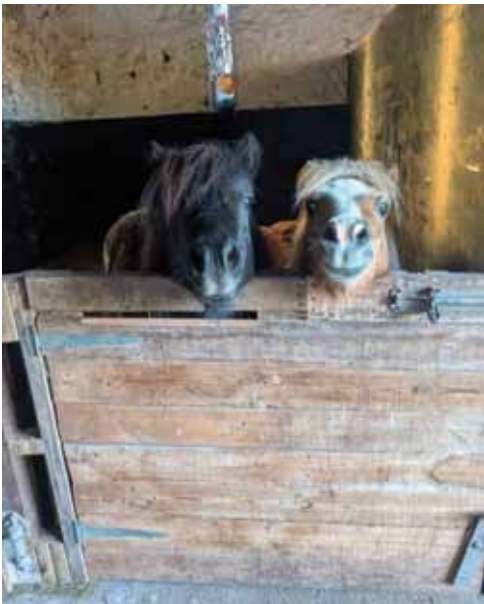
Sweetie & Romeo say goodbye!