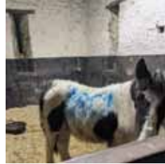
Peter Pan on arrival at Lluest

We also recently welcomed Peter Pan, a sweet young boy who had spent at least part of his short life tethered. He arrived in very poor condition and like Bryn the young pony who we reported on last month, Peter needed to follow a very careful feeding plan. Both ponies are of a similar age and have been following a carefully managed feeding plan designed to allow them to safely and steadily gain weight. Unfortunately, both ponies also arrived with lice and despite our best efforts to treat them, their thick coats prevented the treatment from working properly. So they have had a clip and been retreated to get rid of the lice. As both ponies came to us very underweight and malnourished, their coats had become extremely thick but also very dull and dry. Being clipped, alongside receiving correct nutrition will also help their healthy summer coats grow. We also reassessed their body condition scores. Since being in our care Bryn has gone from a Body Condition Score of 0 to 1.5 and Peter Pan has gone from a 1 to 2.5. Although this isn't the end of their rehabilitation journey, they are both a far cry from where they were when they arrived at Lluest. We're delighted that they are enjoying being out together in the paddock during the day if the weather is nice. It's lovely to see them both starting to feel stronger and more settled, and to have each other's company during their rehabilitation journey.