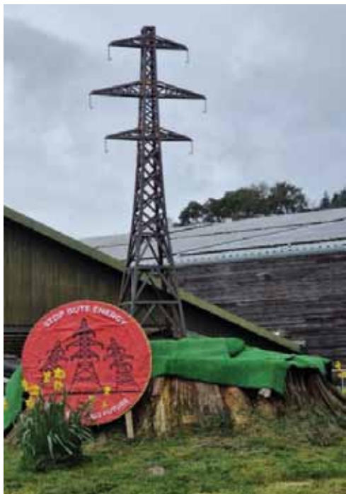
Outside GreenGen Towy Usk consultation at Royal Welsh Showground, pylon scaled at 1/10., kindly lent by Llandoverly Pylon Action Group.

If you would like to show your support for RE-think you can contact us about how to obtain banners, placards, bale stickers (see photo) and posters to put up in prominent places. Have a look on our website: www.rethink.wales where you will also find ways to support us financially. You can also find us on Facebook and if you would like to help us in any way contact us via email: rethinkwales@gmail.com