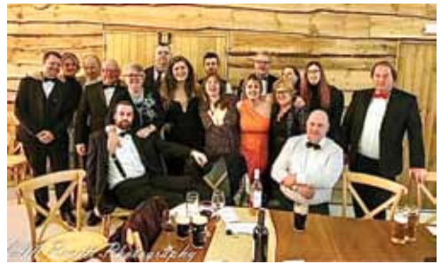
Rotarians having a jolly at Green Grove Barns.