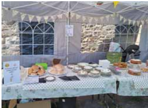
Nice cup of tea and a sit down!

Also we have a Quiz Night coming up, as a fundraiser for our new intakes. It will be from 6.00pm at the Tregeyb in Ffairfach on Saturday 18th May. It will be a ticketed event with welcome drink and buffet.