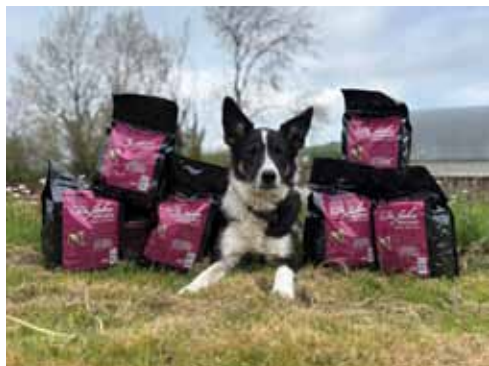
Cheers Llandovery Tyres and Black Mountain Animal Supplies