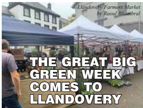
Llandovery Farmers Market by Raoul Bhambral

Llandovery kicks off the Great Big Green Week on Saturday 7 June from 10am – 2pm on Llandovery's Market Square. The Llanymddyfri EV community car project will be showcased at Llandovery Farmers Market, alongside a wide range of locally produced food and drink. Music and live entertainment will play throughout the day.