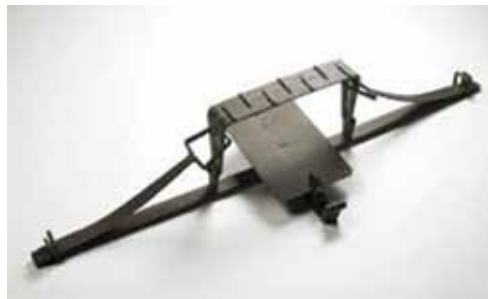
Man-trap, outlawed in 1827

Nearly all the items on view at Llandovery Museum are beautiful and harmless, but there is one notable exception. High above the exhibition area, and safely attached to the rafters, is a large man-trap.