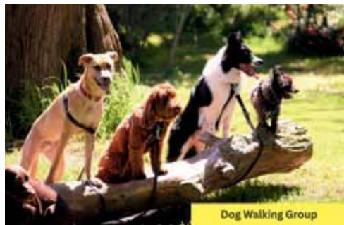
Dog Walking Group

Facebook & Instagram: Hybu Llanymddyfri – Llandoverly More about Llandoverly: www.llandoverly.wales