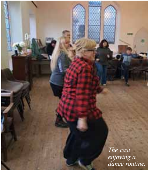
The cast enjoying a dance routine.