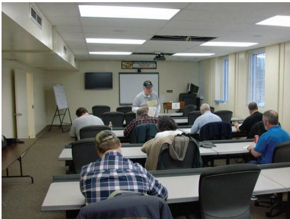
Extra Class 1-09 getting instructions for the exam.