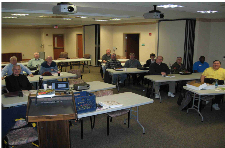
Twelve students are in Extra Class 1-12

These Extra classes are being held on six Saturdays from 9am to 1pm. Joe Lowenthal WA4OVO led the first class on January 14 th from the Baptist Women's Hospital due to a power outage in the building at the Memphis-Shelby County Health Department east complex at 1075 Mullins Station. Then, in two classes Dean Honadle N2LAZ covered a refresher on scientific calculators and Extra Class math, electronic principles, components and building blocks, and electronic circuits. Alan Proffitt AE5RX will cover radio signals and requirements, radio modes and equipment, and topics in radio propagation. Pat Lane W4OQG will expound on antenna and feedlines. Bill Stevens' VE team will offer the FCC Extra Class exam on the last day of class.