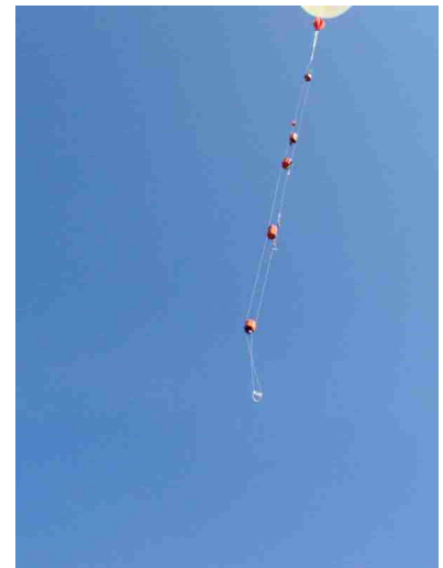
(7) In the air.