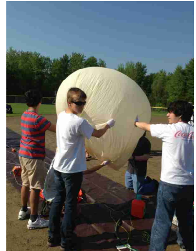
(5) Inflating the balloon.