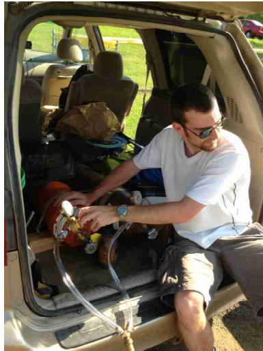
(4) Adding the helium to the balloon.