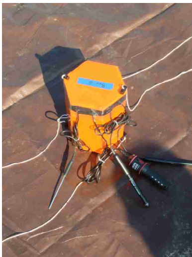
(2) The temperature, CO 2 , and UV sensor package