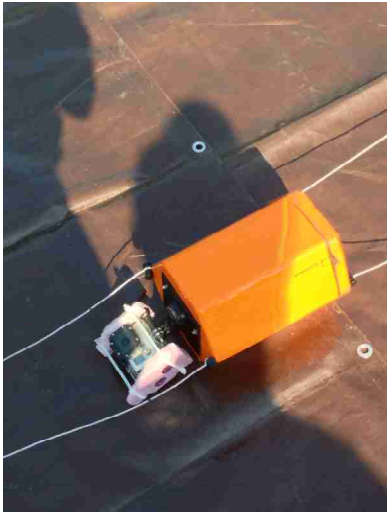
(3) The 1296 wireless camera