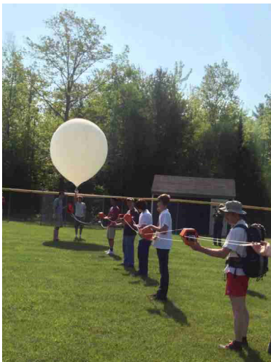
(6) Start of the launch.