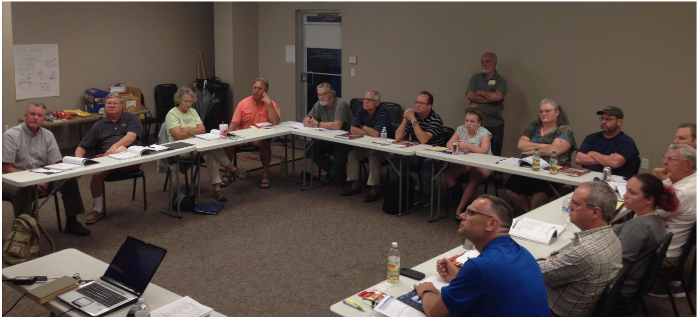
Technician Class 4-15- a full house - hard at work!