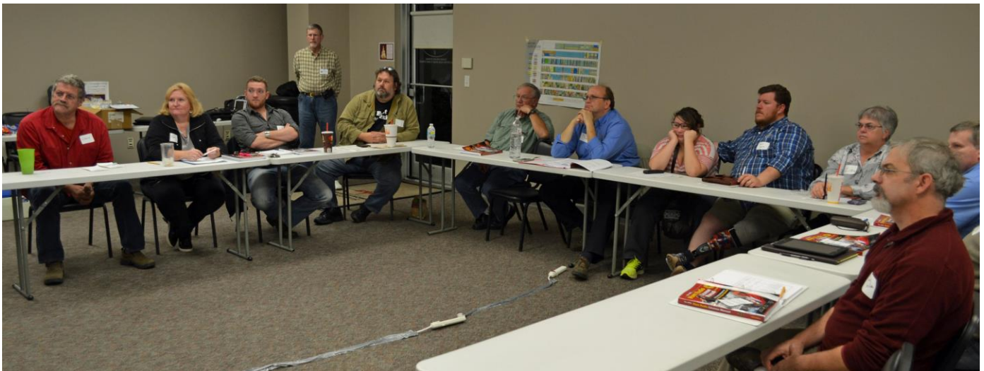
Tech Class 5-15 on first night during introduction to ham radio.