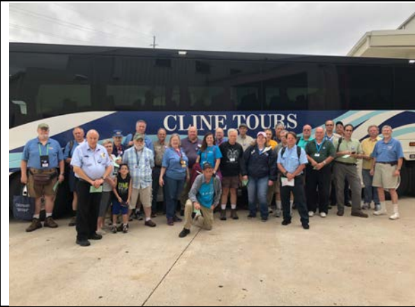
Great socializing on the bus!