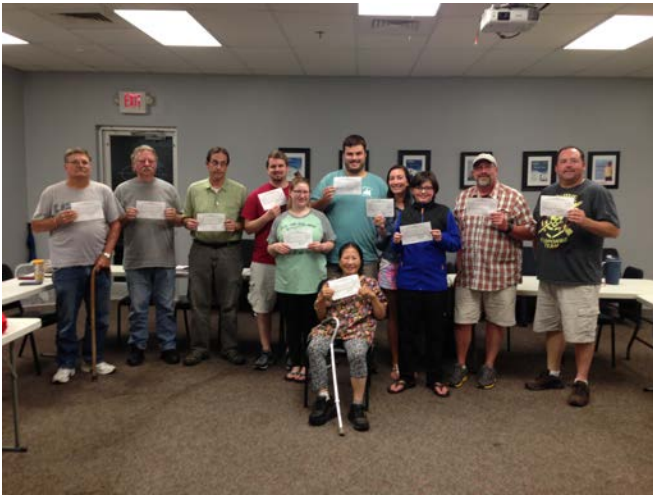
Tech Class 3-18 showing off their CSCEs.