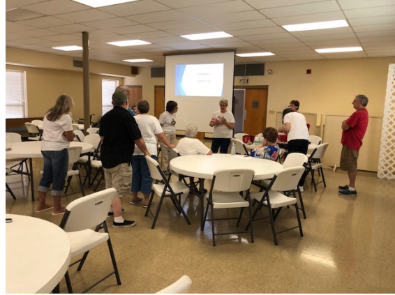
YL Luncheon, August

Please note that we have changed the luncheon location