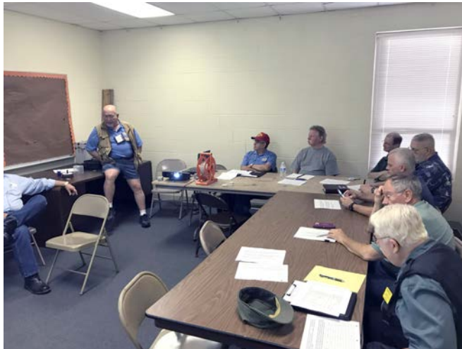
Ham discusses long wire antennas during the Ham 101 session in August.

In August Ham discussed “random wire” antennas.