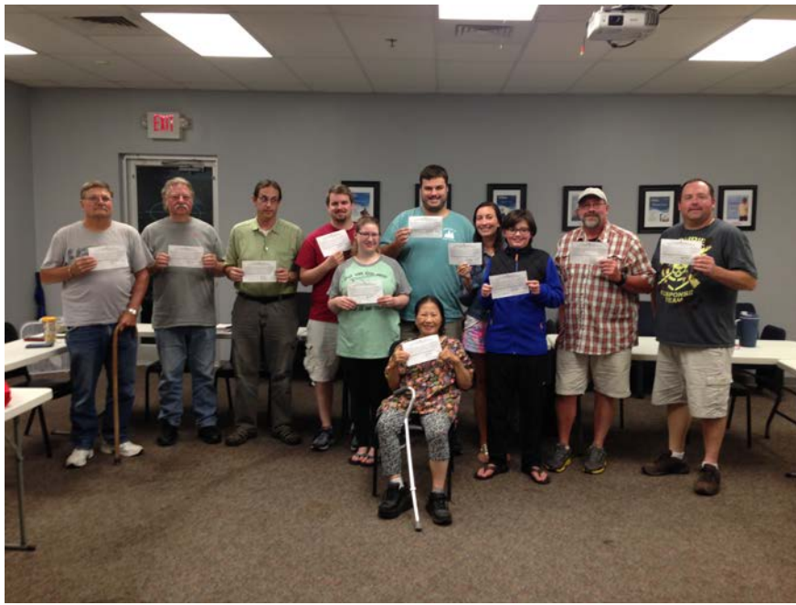
Tech Class 3-18 showing off their CSCEs.