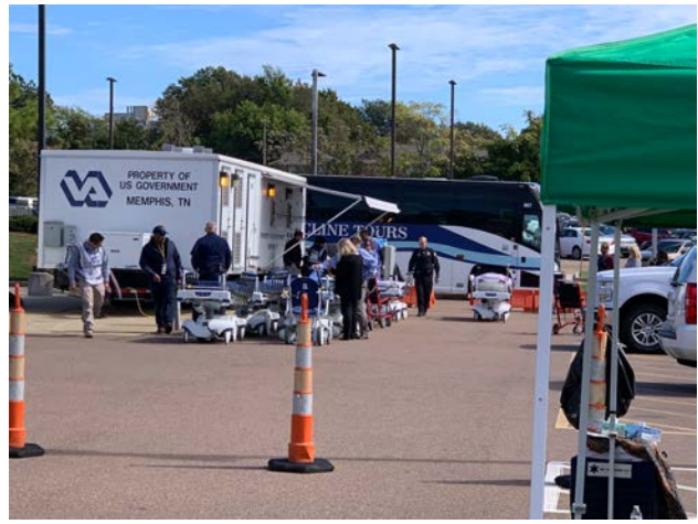
VA Command Center