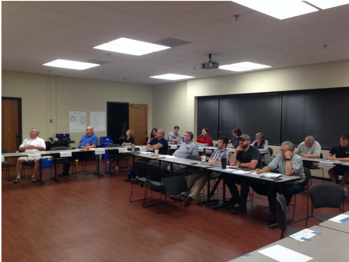
Tech Class 3-19