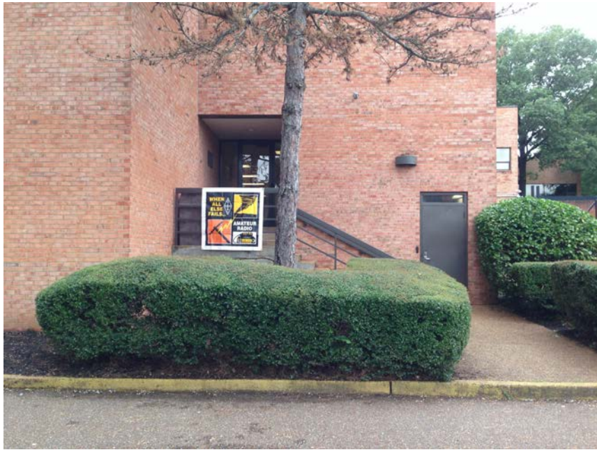
Entrance at Germantown Police Department for Tech Class 3-19