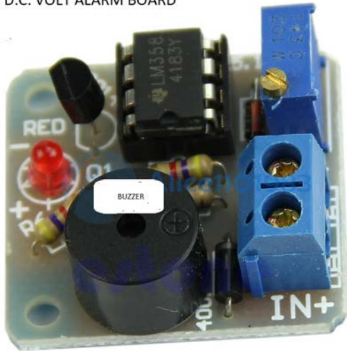
D.C. VOLT ALARM BOARD

Many times when running batteries we want to monitor the voltage to see when they need to be recharged or replaced. On 12 volt batteries, radios may not work properly if the voltage is too low or we could damage the battery if we run it down too far before recharging. Ebay has listings for a 12 VDC battery voltage alarm we can use. This is a completed PC board ready to go. Hook up the two wires from your battery to the board and adjust the low voltage at which the alarm will turn on with the on board variable resistor. When the threshold voltage is reached the LED lights up and the buzzer sounds the alarm. The alarm works well and makes a nice addition to your portable station. The prices on Ebay can be under $2.00 with free shipping. Do a search on Ebay with “12 volt alarm protection board “.