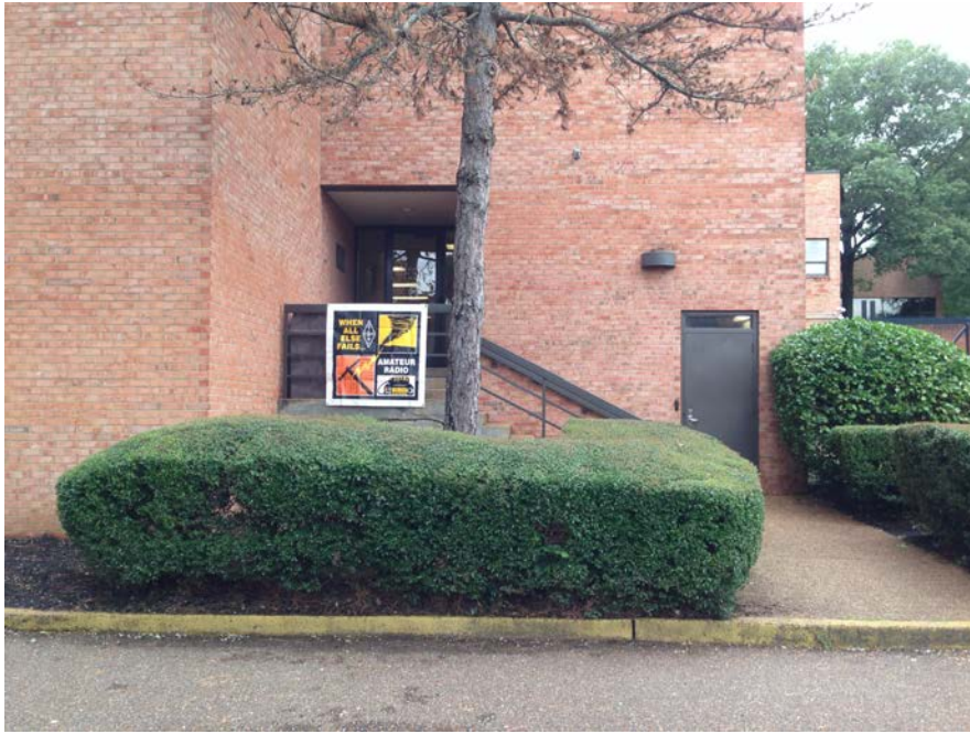
Entrance at Germantown Police Department for Tech Class 3-19