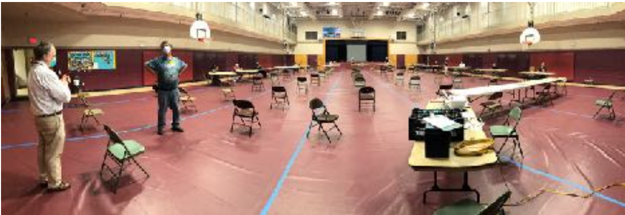
Tech Class 3-20 Test Session

Tech Class 3-20 is being held starting June 25 th on six Thursday nights from 6:15-9:30pm on a combination of Zoom online and planned in person classes. There are twelve students in the class. One of the students is eight years old. Both of his parents are in the class. The classes are being held on June 25, July 2, 9, 23, 30 and August 13. The Zoom classes continued thru the July 23rd class. The Laurel FCC test session was held in the gym at Germantown United Methodist Church, 2323 West Street, using social distancing.