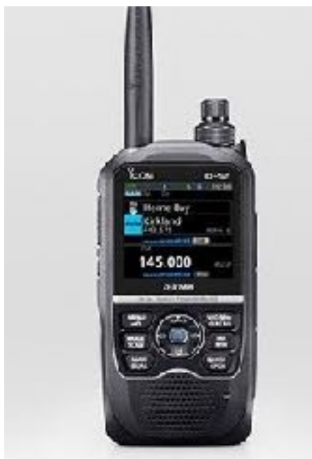
Icom ID-52 (left)

The Icom ID52A/E follows in the footsteps of the ID-51, with similar layout and slightly larger size. The most obvious difference is the display, as a more recent 2.3" color display with has replaced the (long dated) 1.7" dot matrix used in the previous model. The new screen uses transfective technology, which improves visibility in bright sunlight. Usually a light sensor is used with transfective displays to allow automated on-the-fly adjustments of brightness depending on ambient light, but we don't know yet if Icom has indeed implemented this.