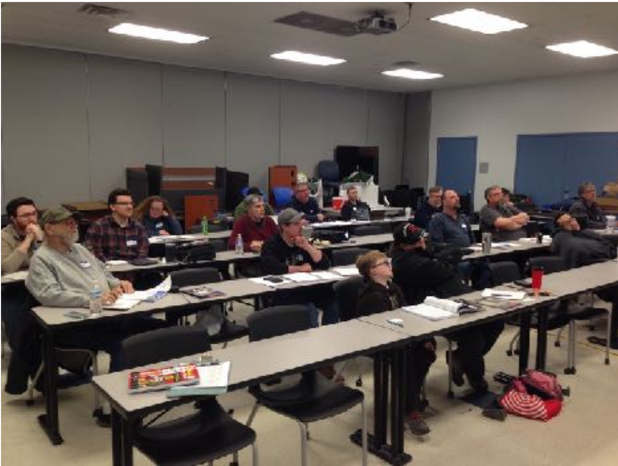
Tech Class 2-20 on first day of class.