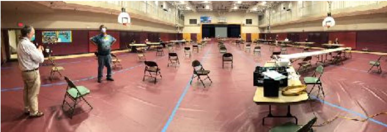
Tech Class 3-20 Test Session

Tech Class 3-20 is being held starting June 25 th on six Thursday nights from 6:15-9:30pm on a combination of Zoom online and planned in person classes. There are twelve students in the class. One of the students is eight years old. Both of his parents are in the class. The classes are being held on June 25, July 2, 9, 23, 30 and August 13. The Zoom classes continued thru the July 23 rd class. The Laurel FCC test session was held in the gym at Germantown United Methodist Church, 2323 West Street, using social distancing.