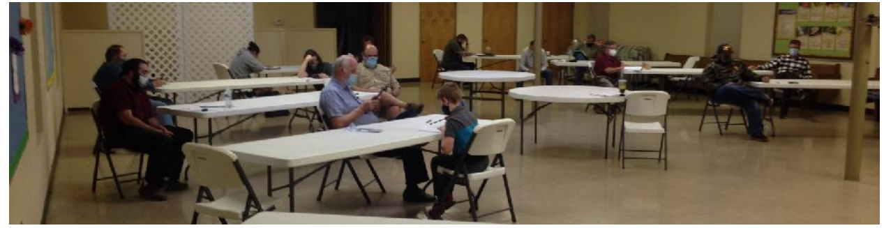
Tech Class 2-21 test session left side