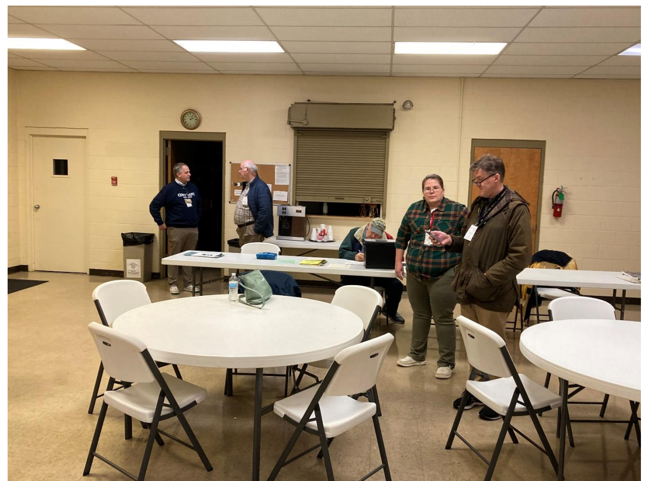
General Class 5-22 VEs