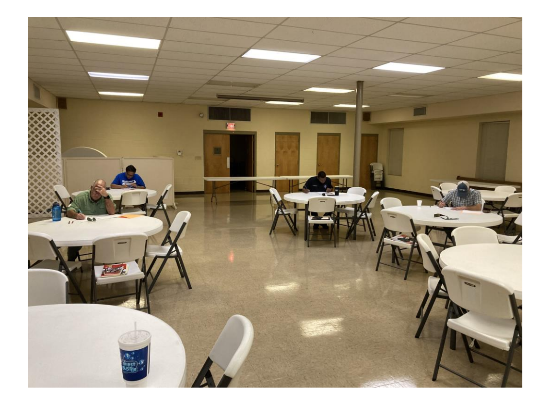
Tech Class 4-22 Testing