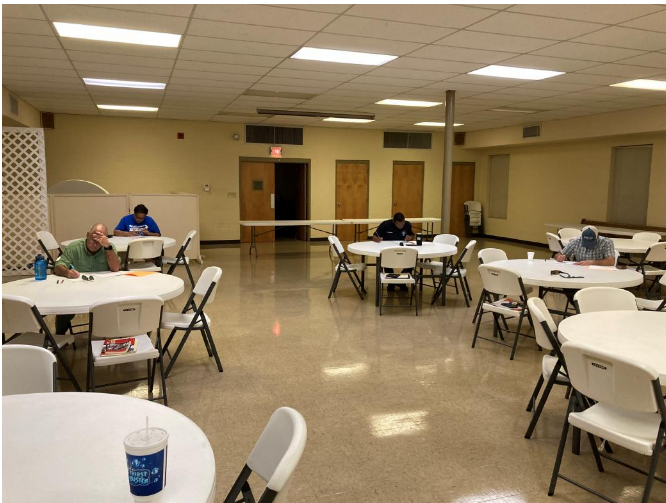
Tech Class 4-22 Testing