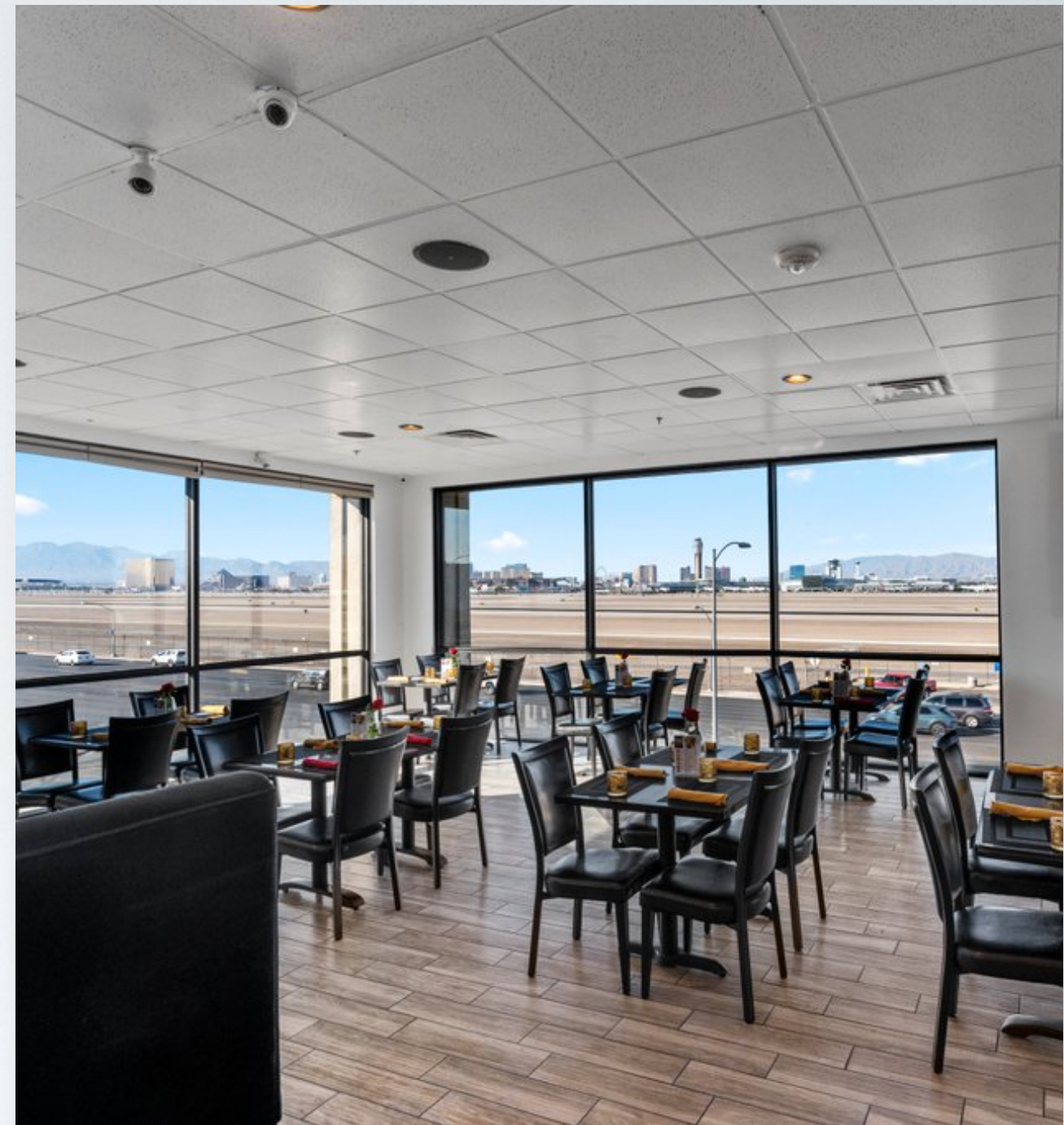
Restaurant space on level 2 with unobstructed views of airport landings and the Las Vegas Strip

This is a rare opportunity to purchase an extraordinary property in a coveted corridor that are seldom available.