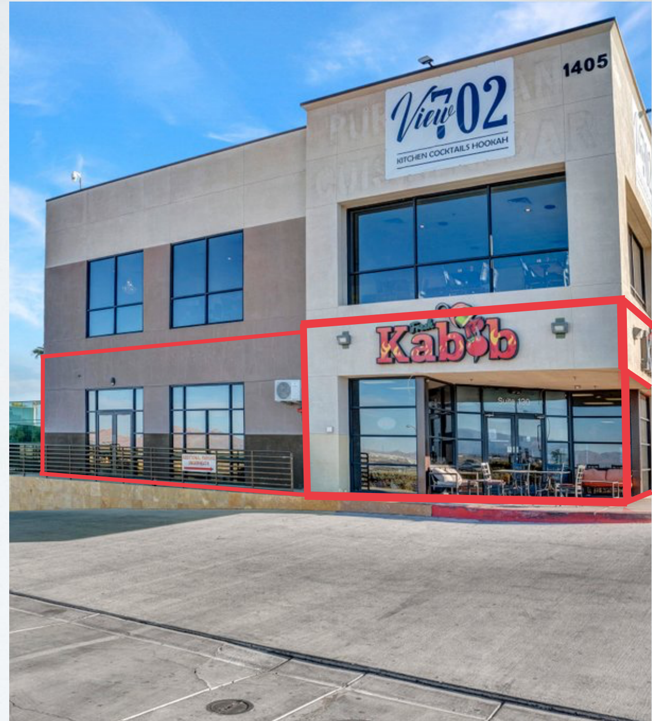
Fresh Kabob pictured lower right and Smoke Shop Supplies pictured lower left