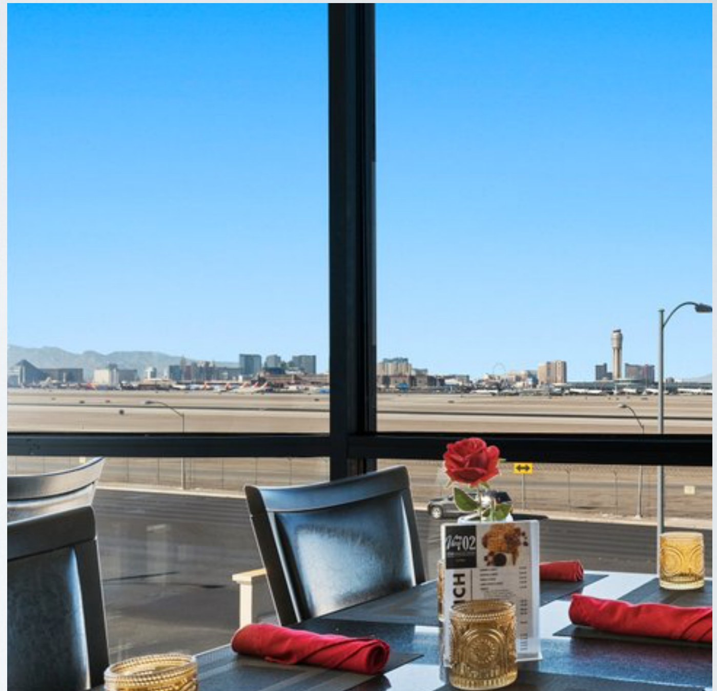
The restaurant retains unobstructed views of the Las Vegas Strip and airport landing strip