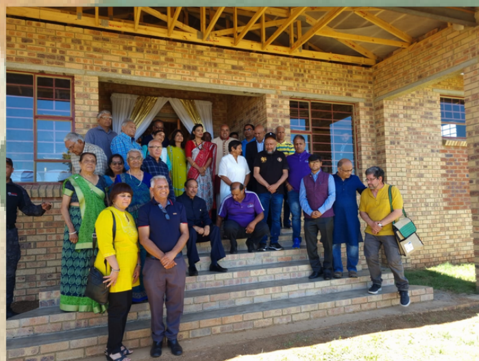
Tolstoy farm in South Africa