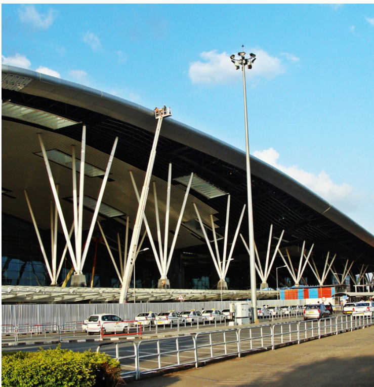
Kempegowda International Airport, Bengaluru