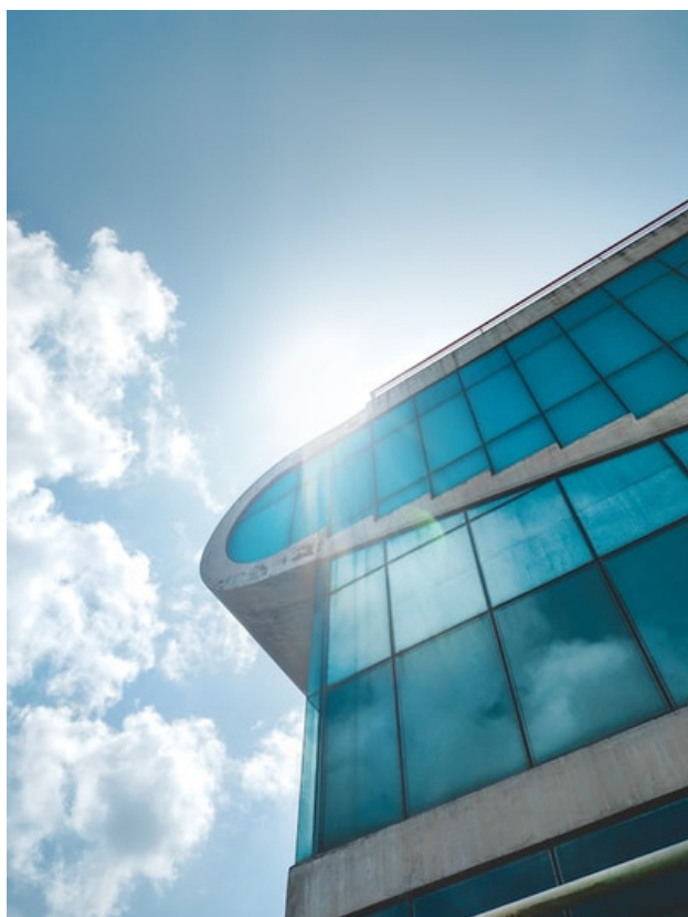
Science Centre, Surat