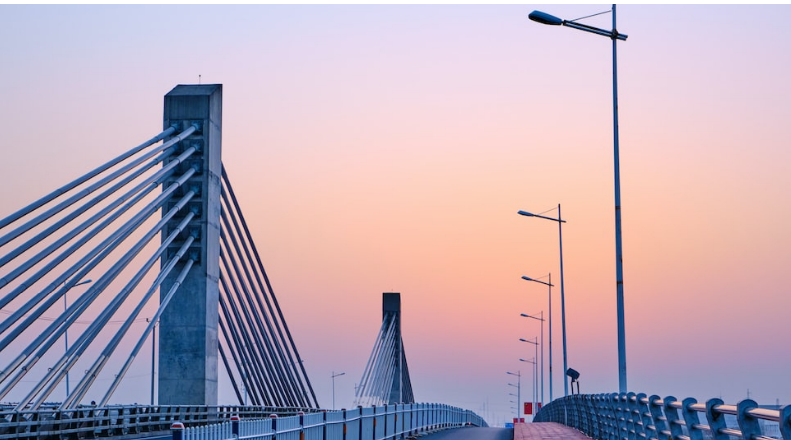
Cable Bridge, Surat