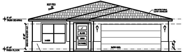
Model: 1388 sq. ft. Elevation - B