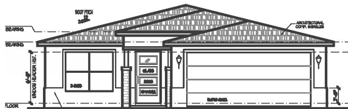
Model: 1726 sq. ft. Elevation - B