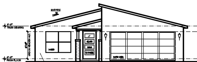
Model: 1726 sq. ft. Elevation - A