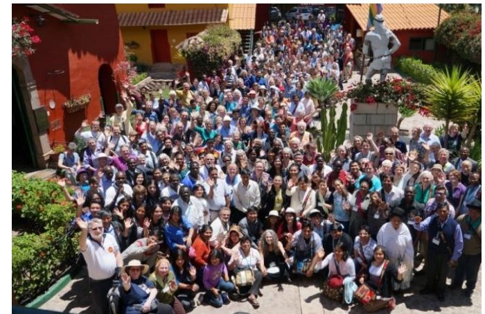
Friends at a world gathering in South America