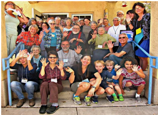
Friends on our front porch