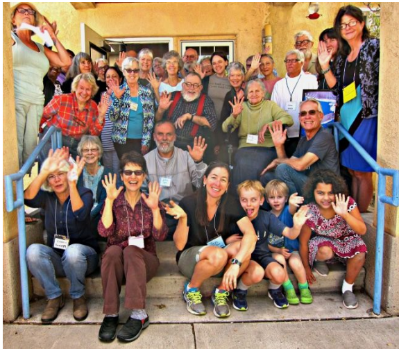
Friends on our front porch

After about an hour of worship, a designated Friend invites everyone to introduce themselves. We invite you to share how you found us and anything else that would help us get to know you. A time follows for announcements, sharing of blessings and concerns, and fellowship both online and in person. Feel free to ask questions or browse our library.