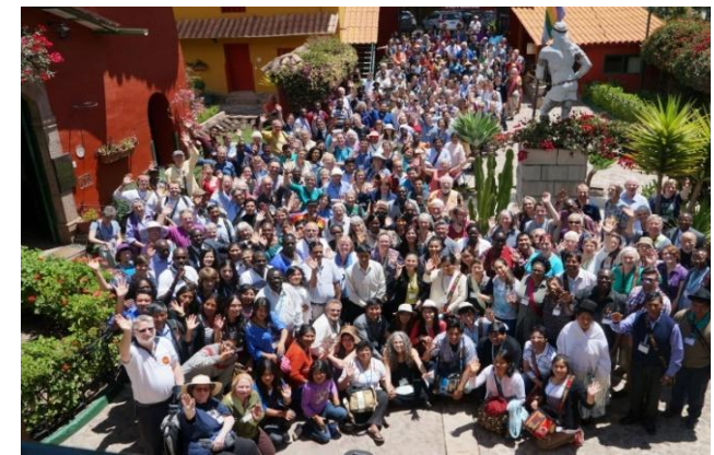
Friends at a world gathering in South America