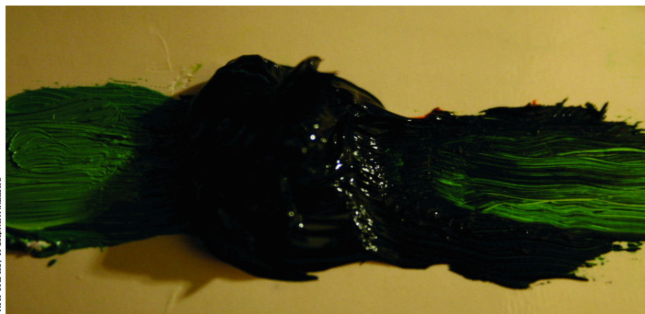
Figure 1: Two Tinting Methods. The middle section is the organic pigment, phthalo green. The left side has been mixed with titanium white, an inorganic pigment. The right side is the translucent tint thinly stained over a white ground. Notice how the translucent tinting method has retained more saturation. Note: A small amount the Indian yellow was added to the original green to adjust temperature.

We have a choice between two very different tinting methods here. First, we could simply physically mix titanium white into the green. See the left side of Figure 1 . However, this creates a mixture with a higher refractive index — an opaque tint. In addition, mixing in titanium white significantly dulls the green. We could not be